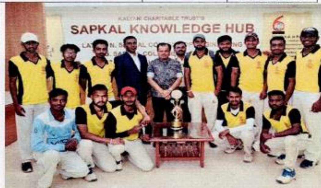
Sapkal Challengers Trophy Runner-up Team