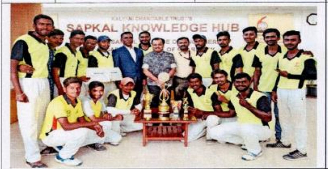
Sapkal Challengers Trophy Winner Team